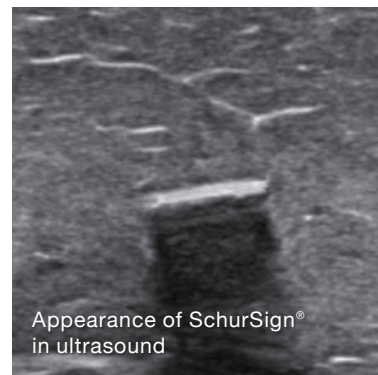
Appearance of SchurSign® in ultrasound