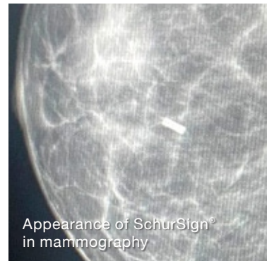
Appearance of SchurSign® in mammography

The delivery system consists of a cannula with a handle, a push rod with a plunger, and an end cap. The tissue marker is retained within the delivery system until placement is desired, where it is delivered through the end port by fully depressing the plunger into the handle. The SchurSign® Tissue Marker delivery system is used to place the SchurSign® Tissue Marker into soft tissue during open, percutaneous, or endoscopic procedures to radiographically mark a biopsy and/or surgical location. The delivery system device has a beveled 12 cm / 14 to 10 gauge needle with 1 cm depth marks and a plunger.