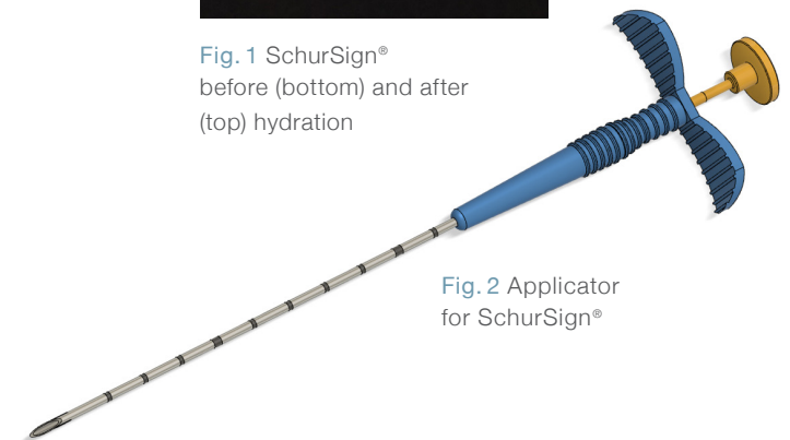
Fig. 2 Applicator for SchurSign ®